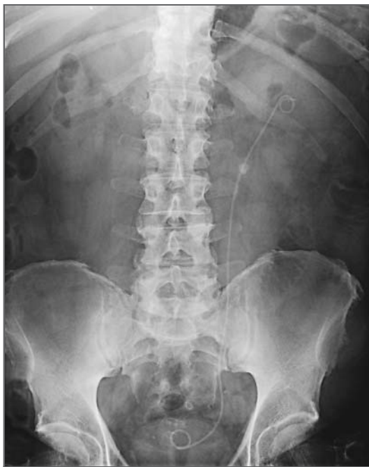
Figure 2. Abdominal Scout Film Showing a Stent and Ureteral Calculus in a 52-Year-Old Man Who Presented with Left-Flank Pain Radiating to the Lower Quadrant and Associated with Vomiting.

The stent was placed to decompress the upper tract, and the pain and vomiting resolved. The patient was treated unsuccessfully with shock-wave lithotripsy, followed by successful ureteroscopy.