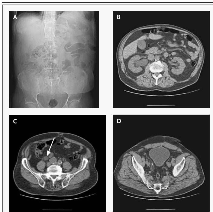
Figure 1. Plain Abdominal Radiography (Panel A) and Helical CT (Panels B, C, and D) in a 68-Year-Old Man with Nausea and Severe, Colicky Pain in the Right Lower Quadrant Radiating to the Tip of the Penis.

The pain associated with ureteral stones has traditionally been managed with narcotics. Howev-